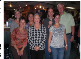
Four generations of the Colombi family came to 9-pin bowling!